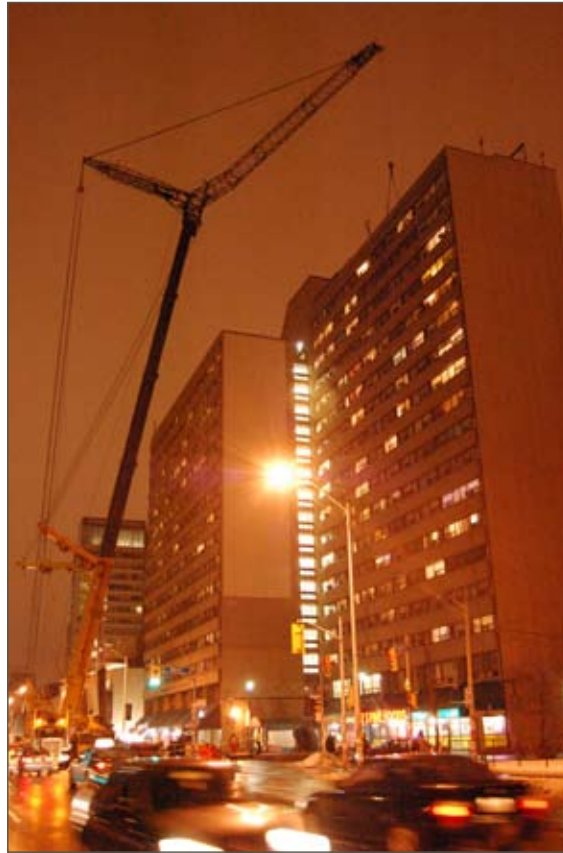
Combined heat and power unit is lifted onto the roof of the David A. Croll apartments.

The goal for the project is to run the cogeneration unit for a minimum of 4,000 to 5,000 hours a year. “We’d like to run it for 6,000 to 7,000 hours a year, but that will depend on the